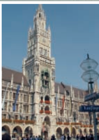
The town hall of the Federal capital is radiant in the bright sunlight.

She herself describes her work as "funky minimalism". Bakery goods or golden frogs characterize her American garden. In her first big project in Europe she however showed herself to be more moderate. The garden that is surrounded by a "suspended hedge" can be divided into four quadrants with the colours yellow, green, red and blue.