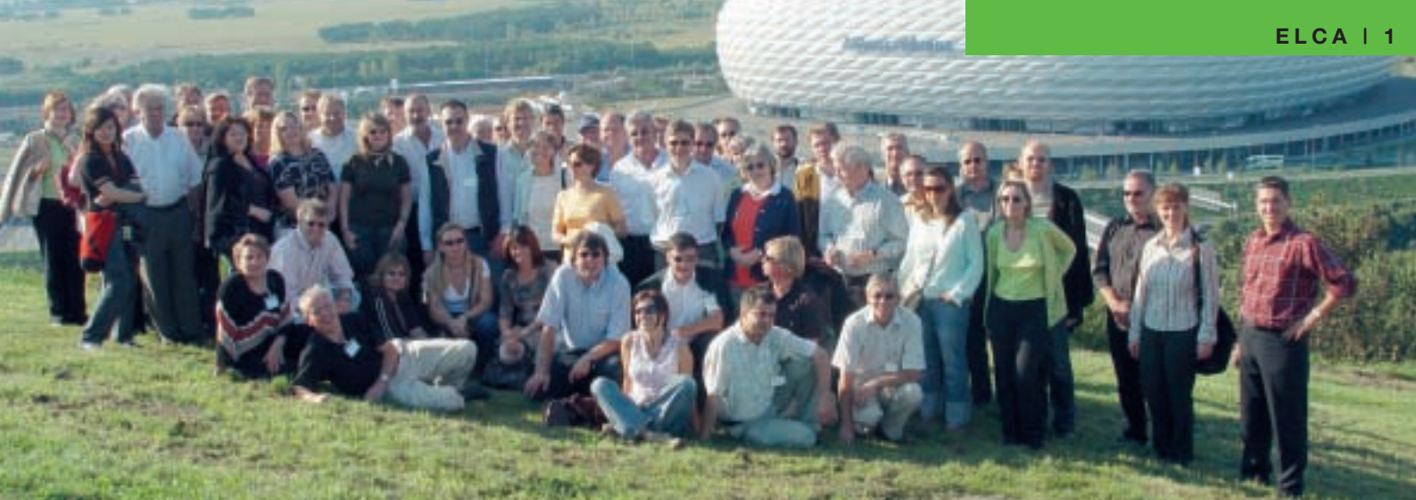
The ELCA study group from Belgium, Denmark, Germany, Estonia, Finland, Luxembourg, The Netherlands, Austria, Poland, Russia, Spain, Sweden and Switzerland in front of the imposing facade of the Allianz Arena. Location: Munich, Fröttmaninger Mountain