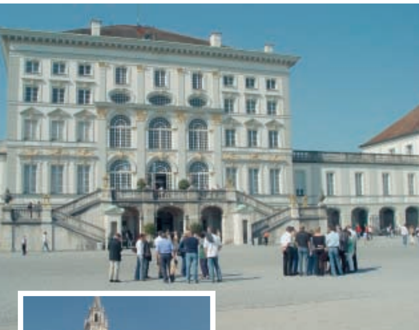
The city tour of Munich included many garden aspects like a visit to the Nymphenburg Palace. In the foreground the English speaking delegation of the ELCA study group.